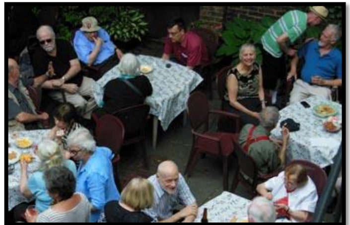
Members and guests in the garden at the Spring Dinner

The Summer Gala is coming your way. It will take place on Sunday, August 23 rd beginning at 5 PM. You should have already gotten a reservation form. If you didn't, or if you lost it, you can download another one from the Plastic Club web site or call the Club and request one to be sent to you. It's always a nice evening and a chance to catch up with other members and see the Members' Choice Casual show which will be on view in the galleries. Don't wait! There is limited seating. Come and enjoy the Club, its garden and its company.